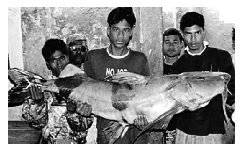
FIGURE 1. Specimen of the Goonch Bagarius yarrelli (Sykes 1839) captured by the local fishermen from the lower part of the Ganges (Padma) River on 3 January 2008. The photograph was taken by local correspondence, Daily Naya Diganta (Bangladesh), 5 January 2008